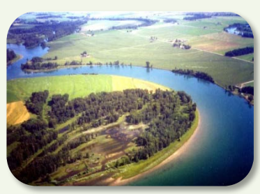
Foys Bend, Photo by Gael Bissell

"We're just really happy to see it will continue to be open space," said Steve Cummings, another participating landowner.