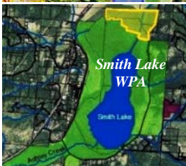
Smith Lake WPA

Brenneman Slough Project protects 155 acres along the Flathead River through a conservation easement held by the Montana Land Reliance. The project adds to an existing block of over 1,000 acres of protected farmlands, wetlands, and riparian forests (blue shaded area).