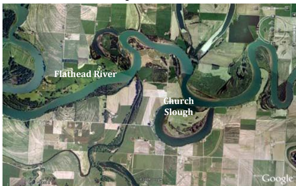
Project area along the Flathead River

The Flathead Land Trust worked with various members of the Louden family over several years to conserve over 1,000 acres of prime farm lands, wetlands, and the river corridor along the Flathead River to the east and west of Church Slough. Recently, the final two of seven separate conservation easements were completed.