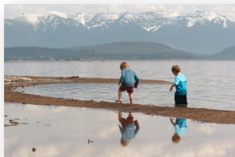
Protecting Our Flathead River and Lake Natural Heritage

The River to Lake Initiative is a collaborative effort to conserve and restore our Flathead River and Lake natural heritage – excellent water quality, outstanding scenic and recreation values, abundant fish and wildlife, and prime soils.