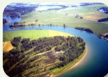
Foy's Bend